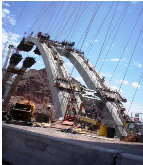
Close-up of the arch during construction