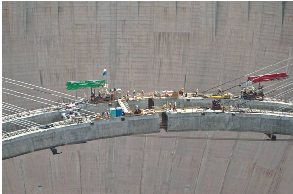
Workers on top finally closing the arch