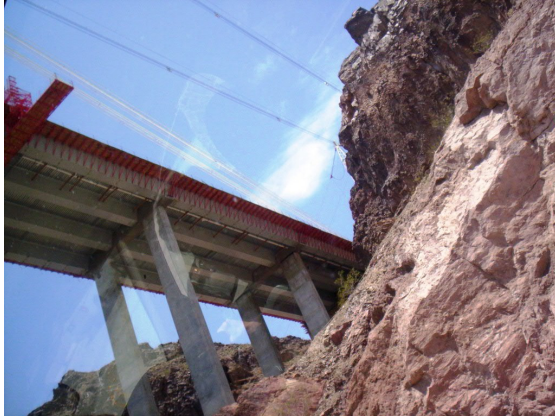
Underside of Bridge

The trouble is that the concrete sides are built so high that you can't see the dam itself, which is about a thousand feet below and a quarter mile off in the distance. I understand that there is a winding trail that leads up to the bridge from the dam parking lot to allow tourists to view the dam from the bridge on the walkway, which is on the other side of the concrete wall separating the walkway from the road. We've marveled at the amount of concrete, the height the men were working at and the overall gigantic scheme of the whole project. The road over the dam will be closed to traffic and will allow only pedestrians on the dam itself – there will be no more through traffic. If anyone is interested in seeing more photos let me know and I'll email you all I have.