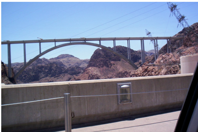
Final completion 2010